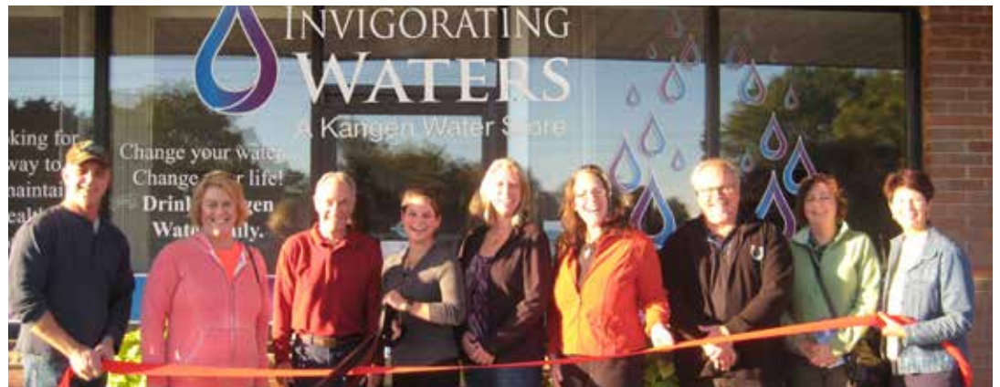
Invigorating Waters, 1084 Fond du Lac Ave. 920-946-0607