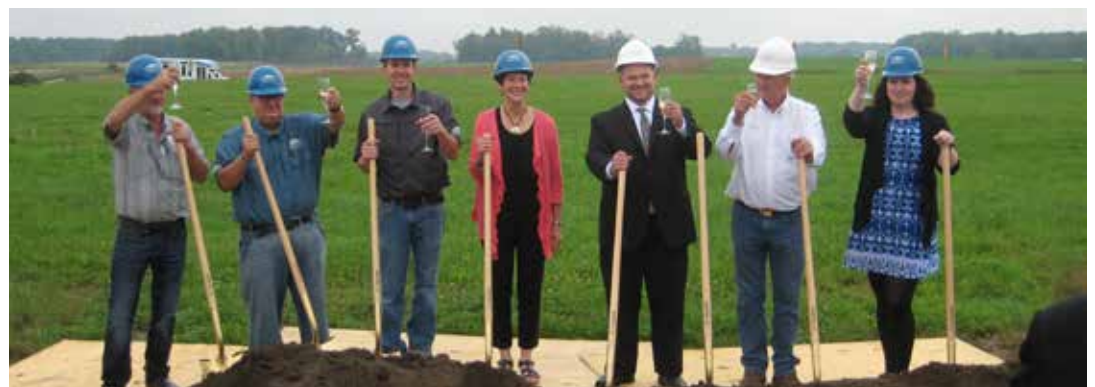
The New Best Western Glo at Plankview Green